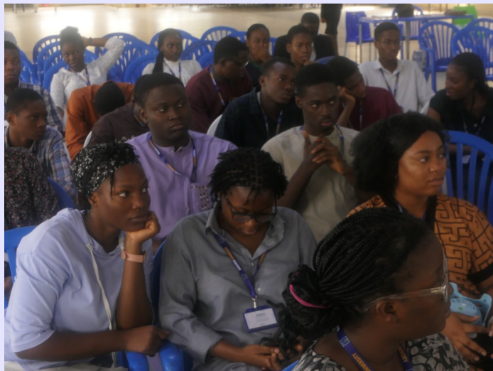
Cross-section of the students