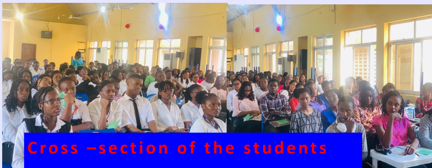
Cross –section of the students