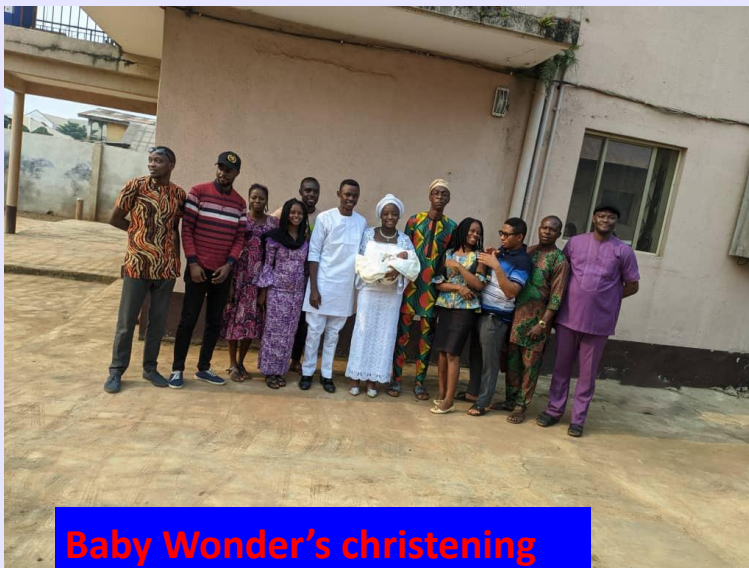
Baby Wonder's christening