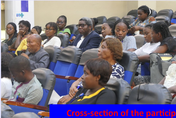
Cross-section of the participants